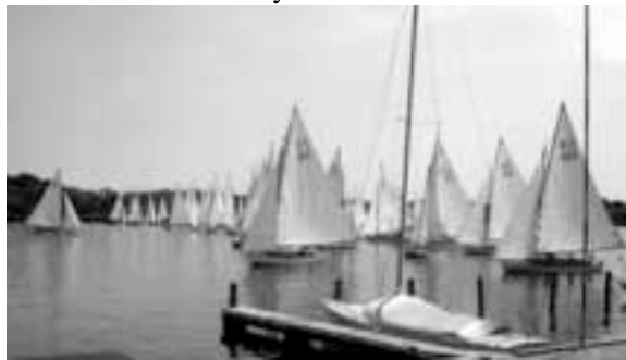
With so many boats the fleet is divided into four groups, then combining for two starts. At the start line the centre of the broad is less than a km wide

Amazingly, Yare & Bure #2 was the winner: a wooden boat, 100 years old and still going strong. J.C.