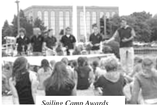
Sailing Camp Awards

Support from many volunteers made for a successful Camp and enabled the Camp to achieve this level of