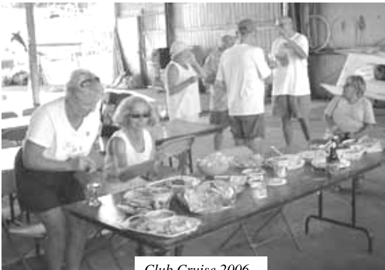
Club Cruise 2006