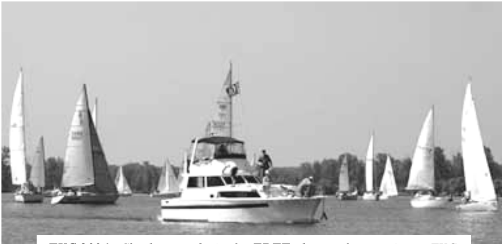
EYC 2006. Check our web site for FREE photos of our racing at EYC. www.bqyc.org