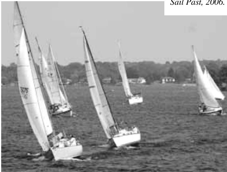
Sail Past, 2006. Great winds!