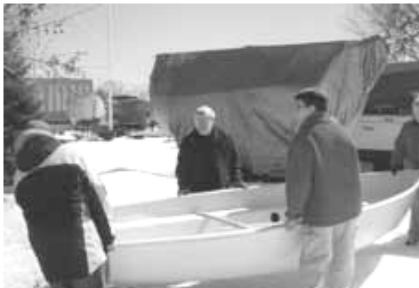
Everybody lift together. The Nutshell dinghy is relatively small but it's heavy and tough. It takes a few members to lift one into the sailing school shed.

plentiful amounts of polyester, filler, foam, matting and cloth are applied followed by a lot more sanding and finally the undercoats and topcoats after which the team can finally see the rewards of a job well done.