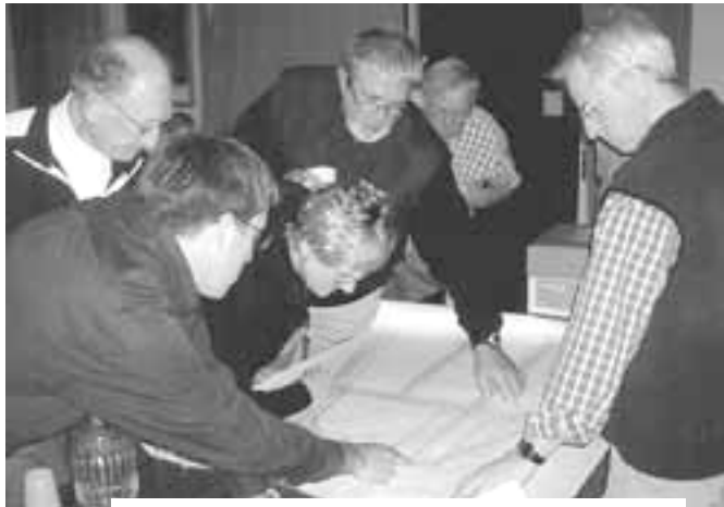
Club members study the city's plans for the proposed improvements to Meyer's Pier. The extensive work has to be completed this year.