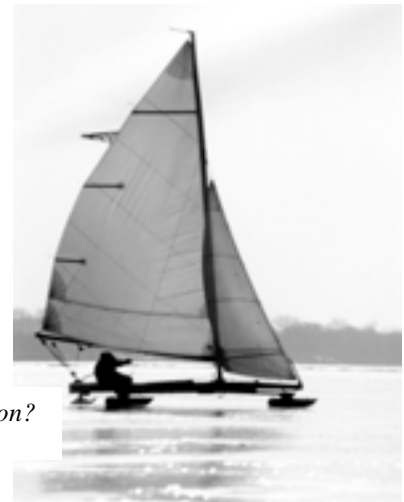
Is ice boating now, finally, over for the season?